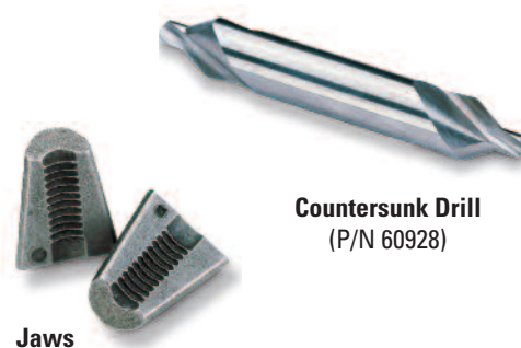
Countersunk Drill (P/N 60928)